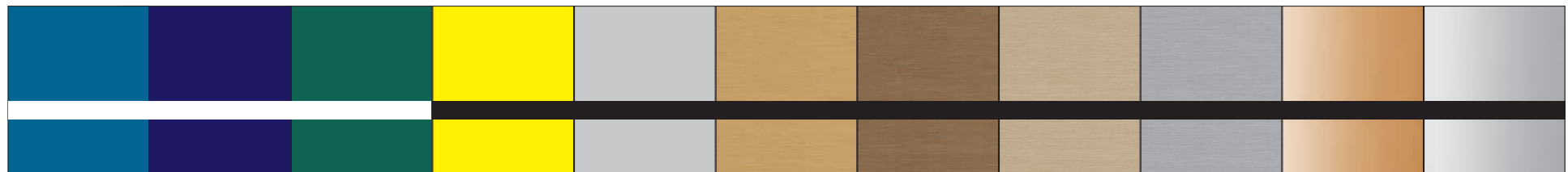
LZ-904-008 blue matte/white