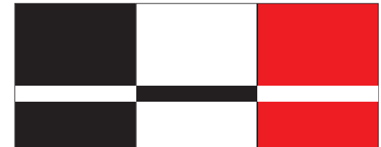
LZ-901-008 black matte/white

Exceptionally thin laser engraving material. It's serve a multitude of purposes in the indoor signage. Perfect for fine detail engraving because of its durable micro-surface.