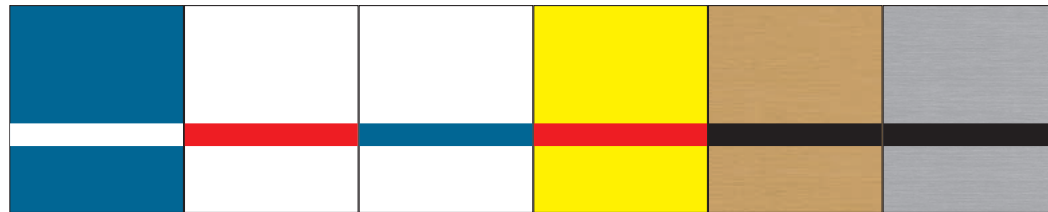
LZ-2904-016 blue matte/white LZ-2916-016 white matte/red LZ-2917-016 white matte/blue LZ-2934-016 yellow matte/red LZ-2990-016 brushed gold gloss/black LZ-2991-016 brushed silver gloss/black