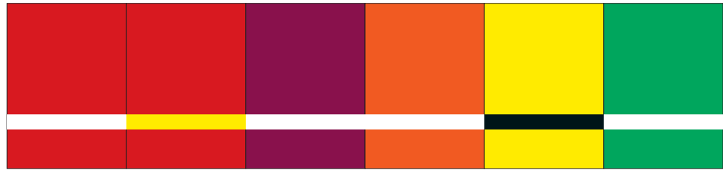
LM9X2-602 Crimson/White LM922-607 Crimson/Yellow LM922-622 Claret/White LM922-612 Tangerine/White LM9X2-704 Canary/Black LM922-932 Kelley Green/White

Answering the needs of today's laser engraver, LaserMax® features include an enhanced heat tolerance and UV stable color foils. Available in a variety of colors, metals and patterns, LaserMax is engineered for cleaner and faster engraving.