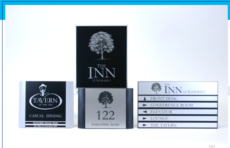
LaserMax® Sign Kit item #9034

You may place your LaserMax® Sign Kit order at www.rowmark.com , or fabricate the signs on your own using the file found under the downloads section of our website.