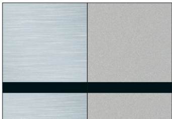
LM922-334* Br. Silver/Black LM922-344* Smooth Silver/Black

*Some LaserMax® foils are not recommended for applications in which UV stability is a requirement.