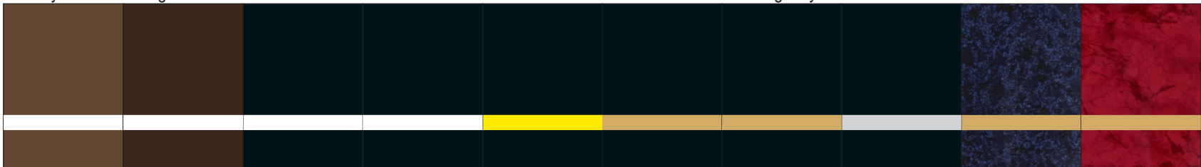
LM922-822 Med. Brown/White LM922-842 Dark Brown/White LM9X2-402 Black/White LM922-422 Gloss Black/White LM922-407 Black/Yellow LM922-417 Black/Gold LM922-427 Gloss Black/Gold LM922-413 Black/Silver LM922-577 Celestial Blue/Gold LM922-677* Port Wine/Gold