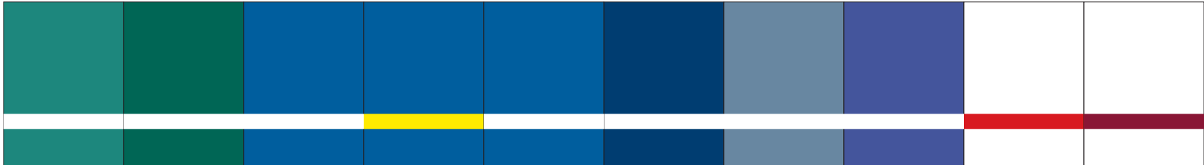
LM922-972 Celadon Green/White LM922-912 Evergreen/White LM9X2-512 Sky Blue/White LM922-517 Sky Blue/Yellow LM9X2-502 Sapphire/White LM922-552 Patriot Blue/White LM922-382 China Blue/White LM922-582 Purple/White LM922-206 White/Crimson LM922-226 White/Burgundy