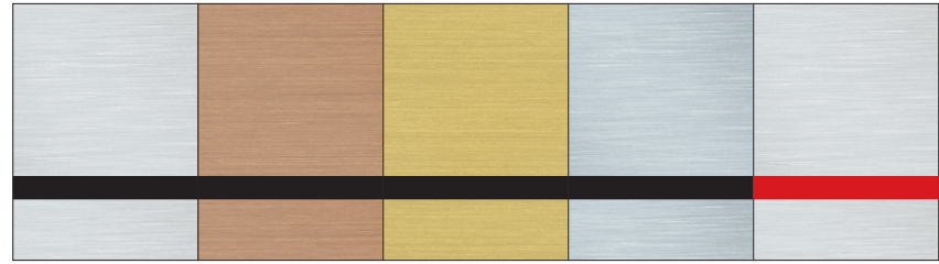
MP9X2-314 Br. St. Steel/ Black MP9X2-864 Br. Copper Penny/ Black MP9X2-764 Br. Antique Gold/Black MP9X2-364 Br. Bright Nickel/ Black MP9X2-316 Br. St. Steel/ Red

Metalgraph Plus ® is the first metallic engraving laminate engineered and formulated for exceptional corrosion resistance, UV stability and outdoor weatherability. Its integrated hardcoat and sub-surface brush finish provides superior protection for exterior applications and is moisture and fingerprint resistant.