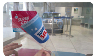
5 layer printing

The XpertJet 1682UR supports up to 5-layer printing, allowing you to create graphics that differ on the front and back. It also offers 4-layer printing, ideal for frontlit/backlit combi prints. 3-layer printing combines CMYK, White & Varnish for striking results. With 2-layer printing, you can achieve graphics with either a glossy or matte finish.