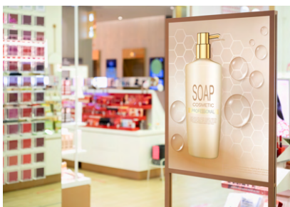
In store advertising

The XPJ-1682UR is ideally suited for the production of a wide array of high quality graphics : in-store promotional prints, customized wall décor prints, exhibition graphics, POP & retail graphics, floor & window prints, fine art prints and more.